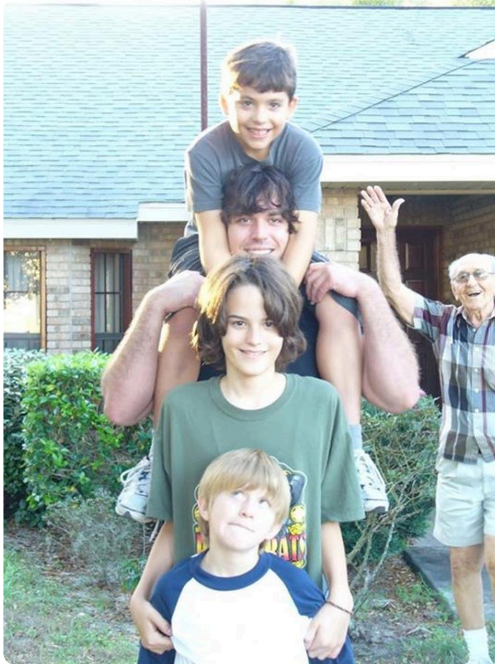
The boys & Dad